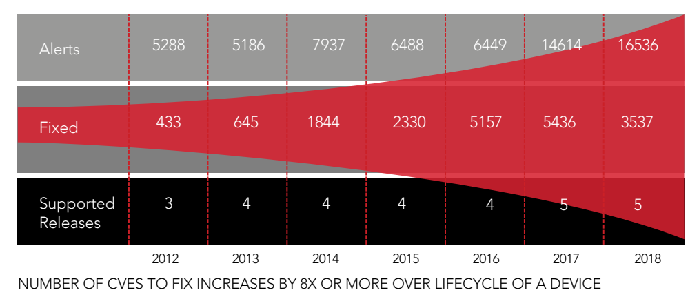
Figure 2. Total cost of ownership and the hidden costs of security monitoring