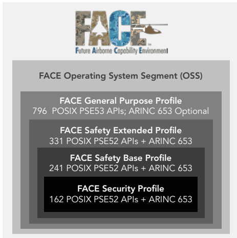
Figure 2. FACE Operating Systems Profiles

In the FACE Technical Standard there are four FACE OSS profiles, scaling from a small, security-sensitive profile to two safety profiles to a general purpose profile, with an increasing number of POSIX calls in each profile.